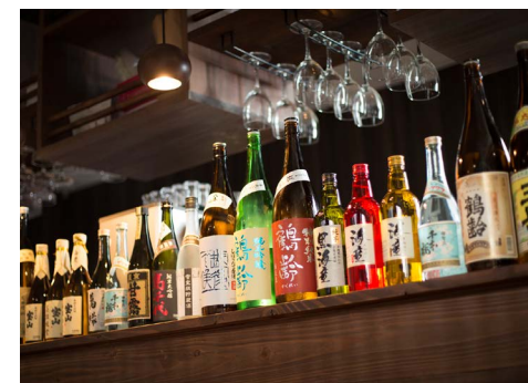
A sweet potato shochu that is only served at our establishment, as well as local sakes