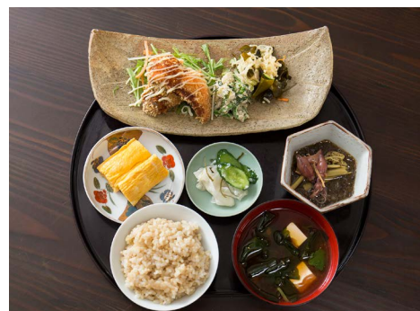
Weekdays only! Evening 1500 yen Set Meal