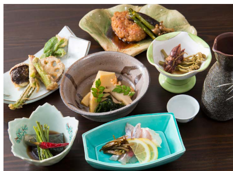
2800 yen Tasting Menu that goes well with sake