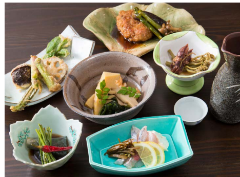
2800 yen Tasting Menu that goes well with sake