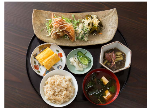
Weekdays only! Evening 1500 yen Set Meal